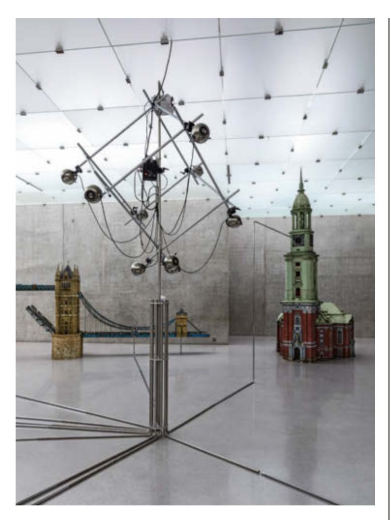
ROLLO, 2019, mixed media, various dimensions Exhibition view BELLEND BIN ICH AUFGEWACHT Kunsthaus Bregenz, 2019–20

Vogel's installations form cycles that are intuitively composed, unreal, distorted—and yet, as a result, they are all the more coherent. The enigmatic, powerful imagery is reminiscent of the rituals in Matthew Barney's Cremastert films, in which the artist, half human, half mythical creature, climbs through elevator shafts or moves through futuristically lit spaces, sometimes wearing a leather apron, sometimes dandyesque orthopedic wear, dragging and jerking his astral body into an immersive emotional landscape. But the pull of Vogel's work does not only stem from her use of instinct, of the body. As obscure as her images may seem, she chooses them consciously. Behind all the twisted tales and hypnotic effects, she has embedded a narrative, stylistic, and technical symbolism that seems fundamental, vulnerable, and above all profoundly human—and it extends far beyond the zeitgeist of our digital era.